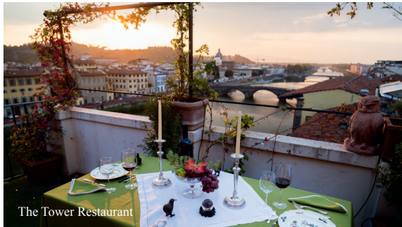
The Tower Restaurant