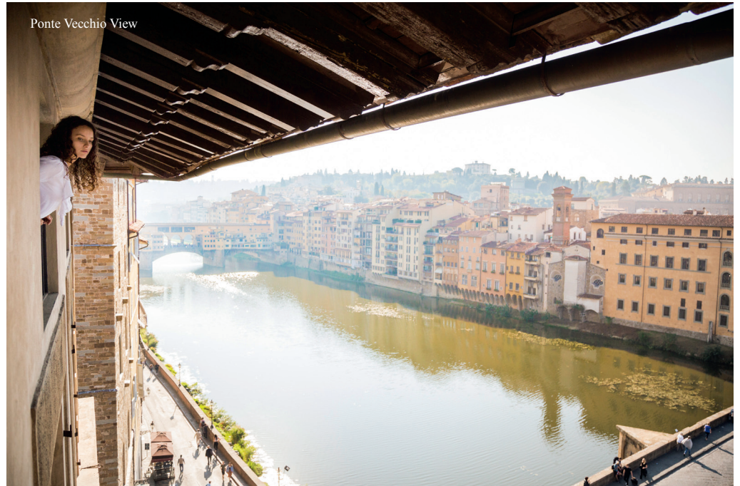
Ponte Vecchio View

Antica Torre Tornabuoni: A Historic Haven for Love. For a truly unique and unforgettable experience, stay at Antica Torre Tornabuoni, a beautifully restored 13th-century tower that offers breathtaking views of Florence. Located on the prestigious Via Tornabuoni, the street for luxury fashion, this historic tower next door to Dior is a fascinating blend of medieval charm and modern sophistication. The property's luxurious suites are adorned with Renaissance-inspired art and original architectural features, adding to the intrigue. At the same time, the panoramic terraces offer sweeping views of the Duomo, the Arno River, and the iconic Ponte Vecchio. Whether you're enjoying a private evening on the patio or exploring the city's romantic streets hand-in-hand, Antica Torre Tornabuoni is a perfect place to celebrate love in the heart of Florence while dining on the terrace.