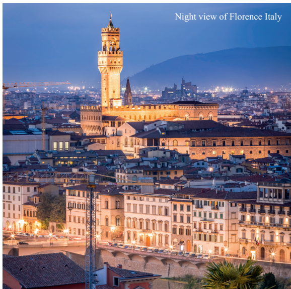
Night view of Florence Italy

Ya sea que te cautive la belleza ancestral de Sicilia o el esplendor artístico de Florencia, un viaje romántico a Italia es una experiencia inolvidable. Estos destinos, con su alojamiento de lujo, su exquisita gastronomía y sus enriquecedoras excursiones culturales, son el escenario perfecto para un San Valentín lleno de romance, aventura y recuerdos eternos. Deja que la magia de Italia te envuelva e inspire tu historia de amor en estos destinos inolvidables.